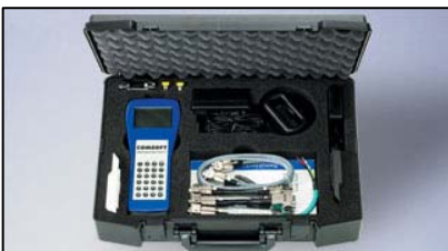
NetTEST II service case