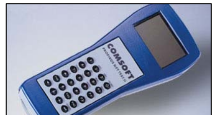
NetTEST II hand-held