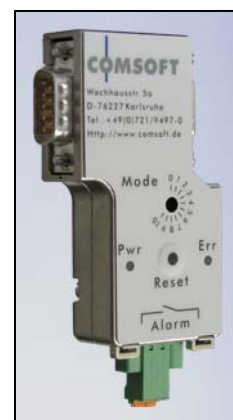
PB Diagnostic Plug

If PROFIBUS errors are detected, the potential-free alarm contact triggers a one-second impulse. Arising error messages can be quantified on a connected, superordinate control system by counting the generated impulses. It is possible to reset error messages at any time by pressing the integrated button.