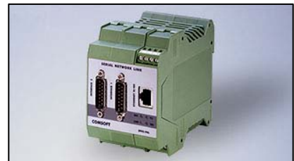
SNL2-E – Serial Network Link